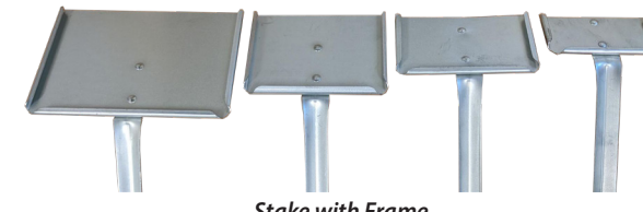
Stake with Frame