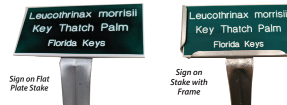
Sign on Flat Plate Stake