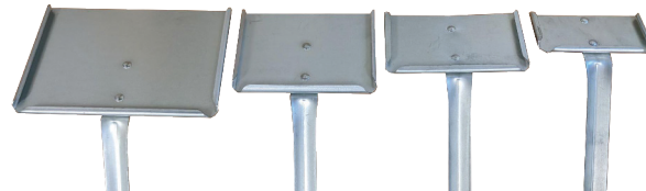
Stake with Frame