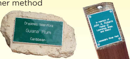
Signs & support stakes are sold separately.