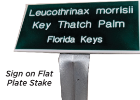
Sign on Flat Plate Stake