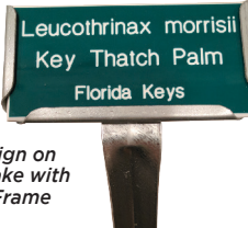
Sign on Stake with Frame