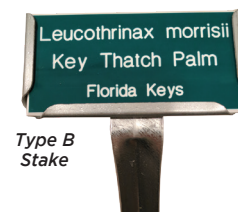
Type B Stake