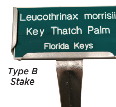
Type B Stake