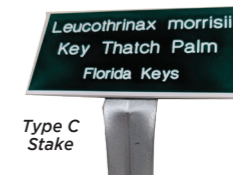
Type C Stake