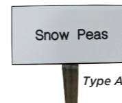
Type A Stake

Please note that the bend at the top of all stakes is included in stake length!